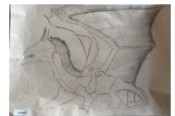
Samiha - 6B