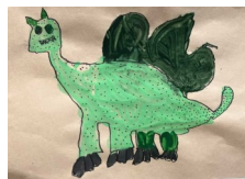
Inaayah - Blue Class