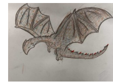
Zoya - 5C