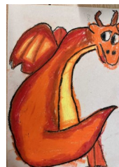
Amelia - Yellow Class