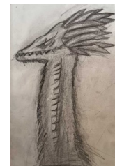
Ibrahim - 4D